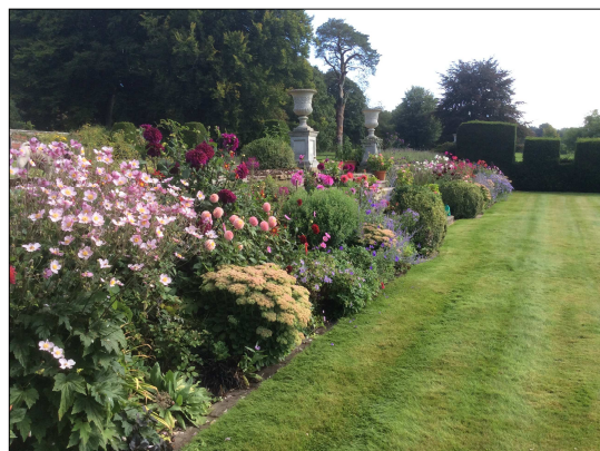
The garden at Armsworth